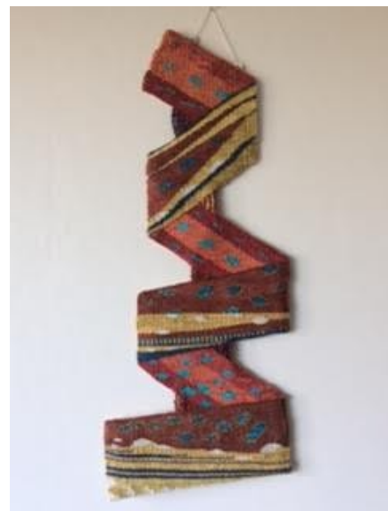
57 Degrees North

Above are the tapestries which Trisha entered - 'Carbon Capture' and '57 Degrees North'