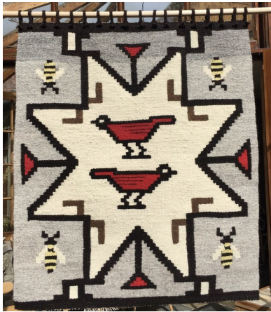
Birds and Bees Hanging

north west Nepal during her textile adventure in Nepal a few years ago.