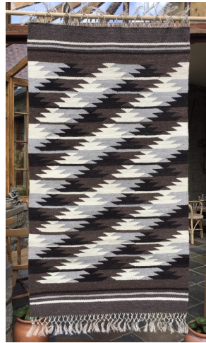
Dhaka Inspired Rug

The exhibition should be well worth visiting if you can get to it in September.